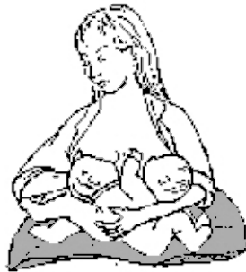
With two babies