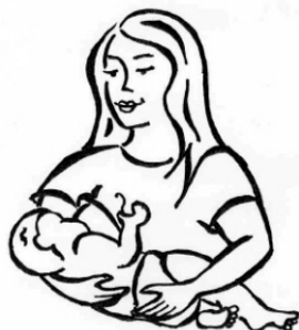
With one baby