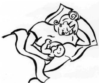
With one baby