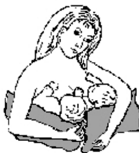
With two babies