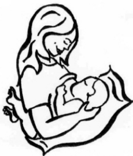
With one baby