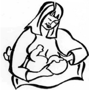
With one baby