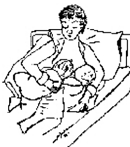
With two babies